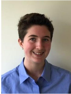
Hometown: Buffalo, NY Brown University: BA Comparative Literature