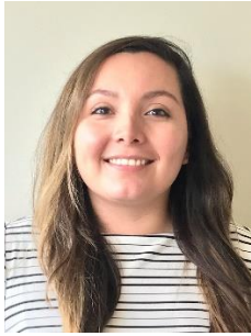
Hometown: Pawtucket, RI Providence College: BA Psychology